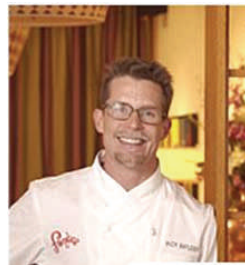
Award Winning Chef, Oklahoma Native www.fronterakitchens.com

At the event, Chef Bayless addressed the guests and spoke about his commitment to locally produced ingredients, about his love of the pleasures of the table and his life-long enthusiasm for the "food of a place". He described growing up in a family that ran an Oklahoma City barbecue restaurant and how, from his earliest experiences of shopping for ingredients with his father, he saw the value of locally produced, high quality ingredients. Chef Bayless truly inspired the group with his stories about how recipes are full of history, emotion and a sense of family.