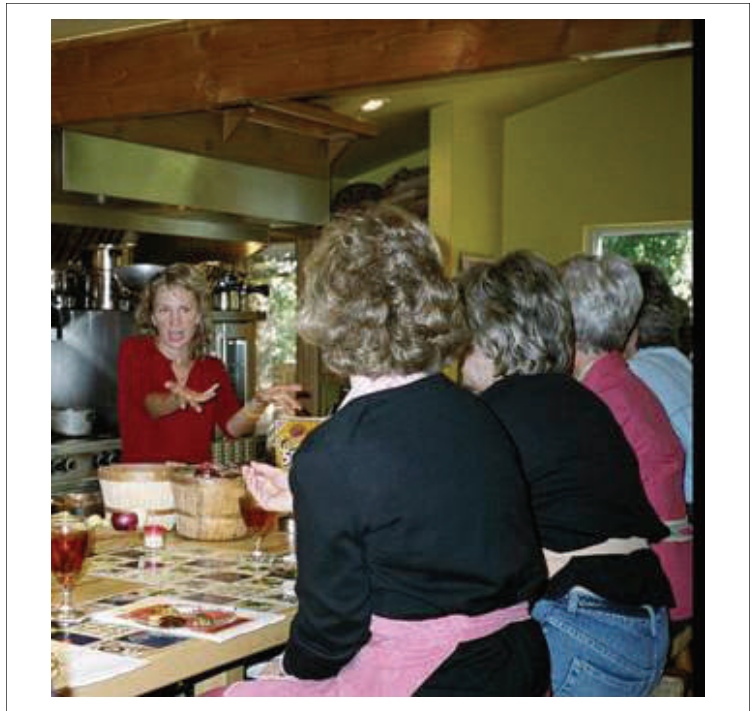
Farm to Table Cooking Class—November 5 Heritage Turkey and Chicken featuring Horn Family Farm and Walters Hatchery

Slow Food Upcoming Activities: Convivium Dinner February 26th (tentative) Mardi Gras Benefit to Support Producers in the Louisiana area); Agritours to OK producers (April & Octo-