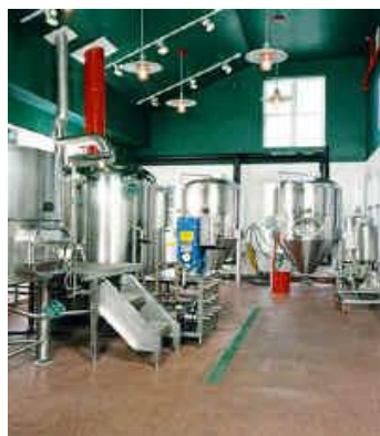
Choc Beer Distillery at Pete's Place